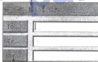
(II) Figure 2

36 at the tools menu insert date and time option.